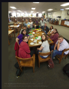
JHS Book Club's Last Meeting of the year- snacks and a book exchange