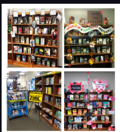
A small sampling of our many displays. #advertisingworks