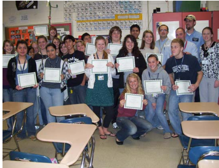
On December 11, IB Env. Science students earned state certification for stream monitoring and bugs identification!

Our inaugural group of IB juniors is off to an outstanding start. When they started last semester, our IB students were pioneers - forging ahead into unknown territory. In only a few months they have come so far. Their growing maturity, character, and commitment reveal that they are well on their way to becoming not only excellent students, but scholars as well. On the following pages, you will see quotes from many of our IB students answering the questions of why they chose to be in the IB Programme and what advice they would